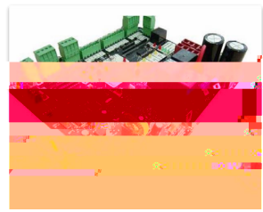
@ [ I j k i 'Xc g f n \i' j l g g p '

( Cf n' dXbX^\`Xe[ '\_^\_ 'KaZXgXZ'kp ) Lj\`lemif ed \ekXcp' ]i\`e[ cp'd Xk\i\`Xg'Xe[ '\ Zfd gpp'n'k\_l'f? J jkXe[ Xi[j 2 * @'j j l 'kXYd' ]f i '\_^\_ $k\ld g\iXk i\`lemif ed \ekj # j l Z\_Xj'gf n\i' ]Xe j #j\`m\i'gf n\i' j l ggc\j #\kZ%