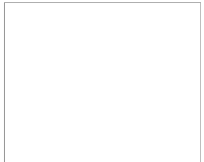
Fig4. Reverse Recovery Charge vs di_F/dt